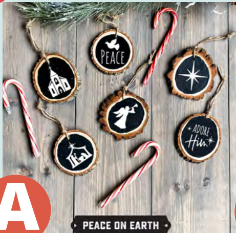
PEACE ON EARTH