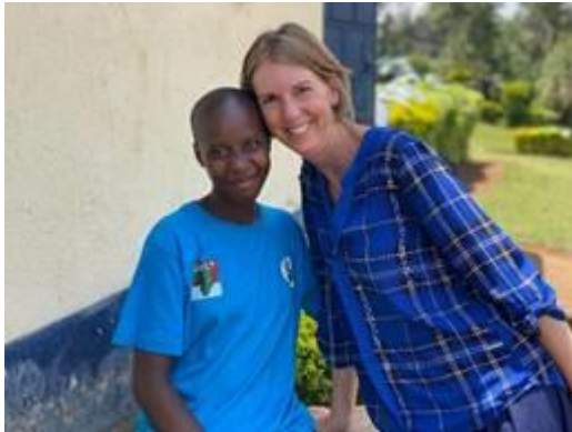
Never a Dull Moment Posing with one of the girls from P24 Rongo.